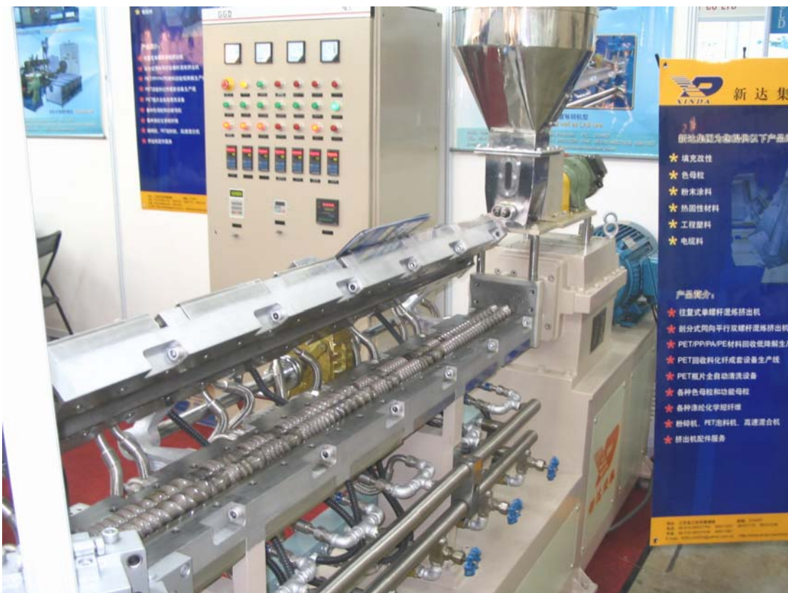
Main Machine of PSHJ-35 Processing Line (L/D:40)

The harmonized modular conception of screws and barrels for optimally realizing all processing steps (feeding, conveying, plasticizing, dispersing, reacting, venting, pressure build-up).